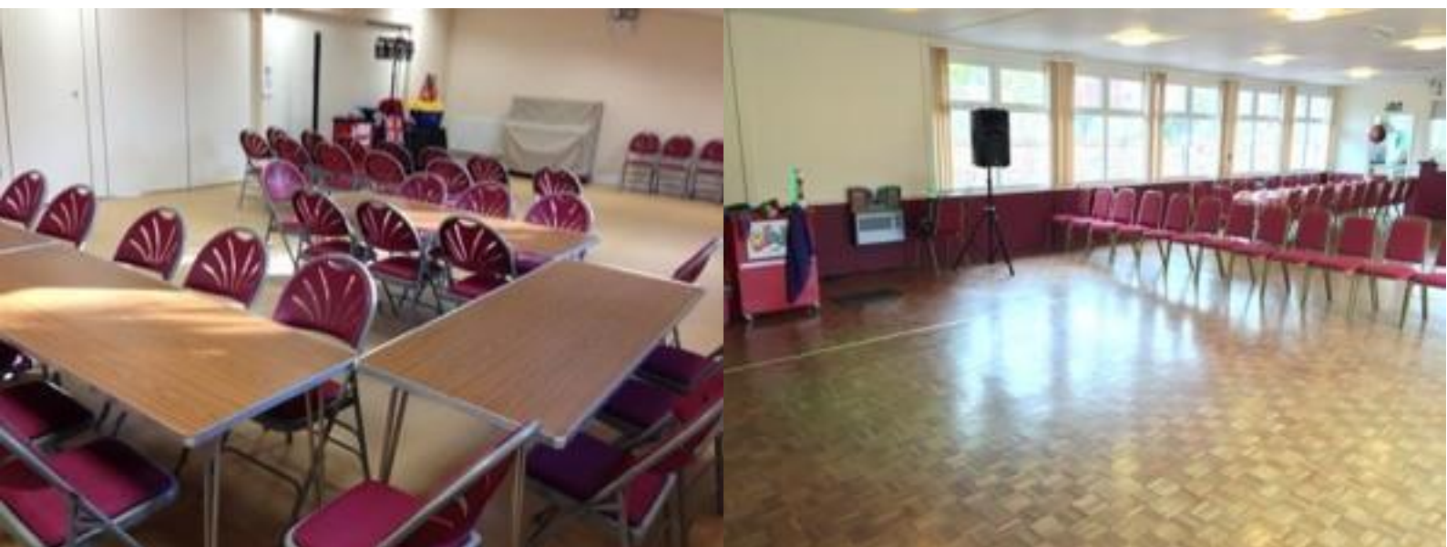
Chairs for parents